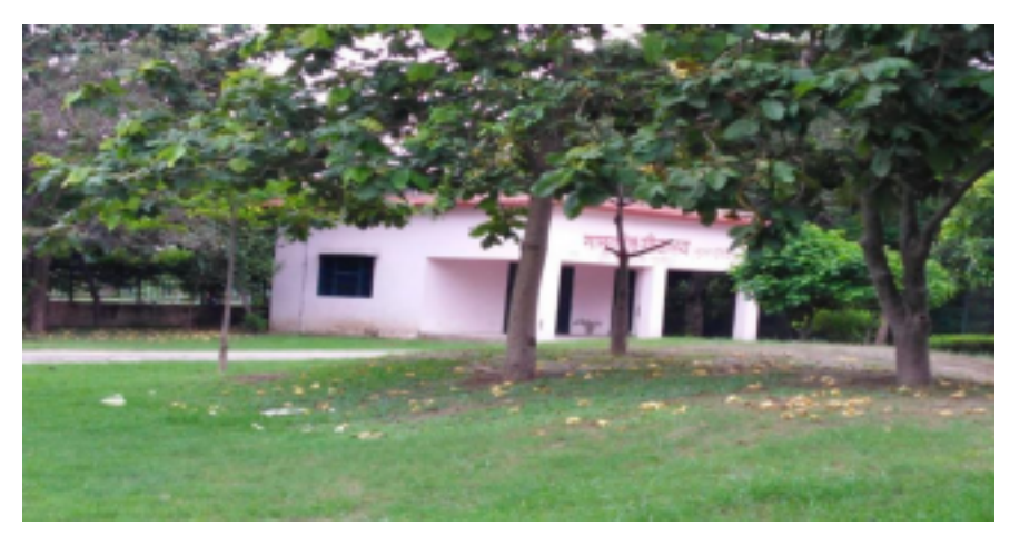
Figure 2: Closed Toilets at Tau Devi Lal Park