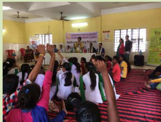
Siliguri, West Bengal