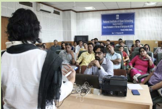
NOIDA, Uttar Pradesh