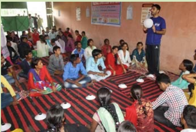
Cholapur, Uttar Pradesh