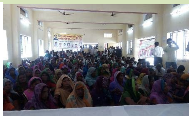
Lalitpur, Uttar Pradesh