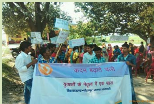
Varanasi, Uttar Pradesh